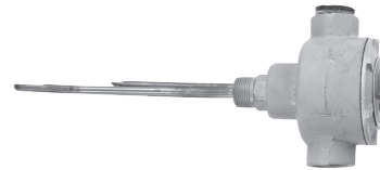
E2 — Dimensions (Inches)