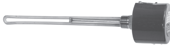
E1 — Dimensions (Inches)